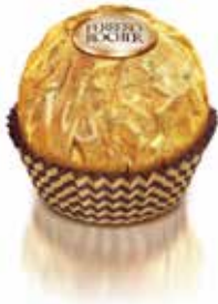
The FERRERO ROCHER® trade-dress is a trademark owned by Ferrero.

often serves the same function as a trademark – identifying the source of products in the marketplace – in some countries it can generally be protected under trademark laws, and in a few countries it can be registered as a trademark. Depending on your country, if trade dress cannot be registered as a trademark, it may nonetheless be protectable under unfair competition laws or actions for passing off.