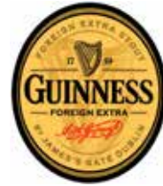
Label for GUINNESS® Foreign Extra Stout by Diageo Ireland.

which charges its operating companies (in high-tax jurisdictions) royalty fees for the use of the trademarks.