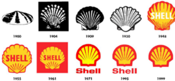
The SHELL® logo is property of the Royal Dutch Shell group of companies.

Many trademarks have changed slightly over the years in order to modernize the image of a business or adapt to new advertising media. You will have to consult with the trademark office(s) concerned or a trademark agent as to whether a specific change will require the submission of a new application and payment of relevant fees.