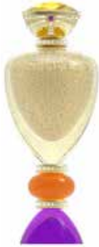
Bottle of perfume – DM/083330 BULGARI SPA