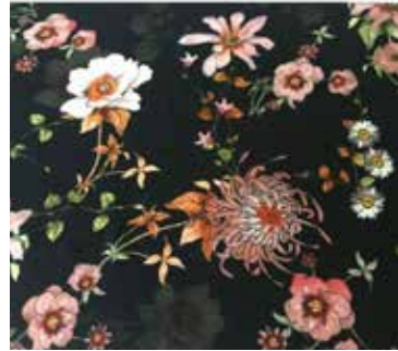
Fabric patterns – DM/094167 IPEKER TEKSTIL

In some countries, the applicable law recognizes the possibility of copyright protection for some designs, for example those incorporated in textiles and fabrics.