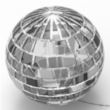
Floor lamp – DM/081858 WIN SRL

While the functional elements of a lamp will generally not differ significantly from product to product, its appearance is likely to be one of the major determinants of success in the marketplace. This is why industrial registers in many countries have a long list of designs for household products such as lamps.