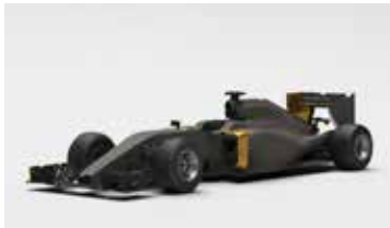
Miniature vehicle (toy) – DM/090181 RENAULT S.A.S