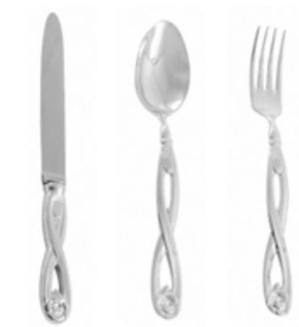
Set of cutlery – DM/080996 SAVIO FIRMINO DI SAVIO GUIDO E C. S.N.C