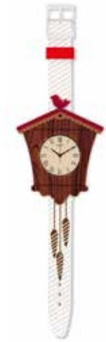
Wristwatch – DM/091792 SWATCH AG