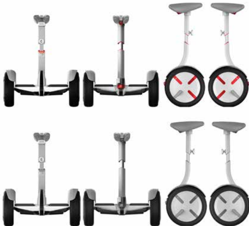
Two wheeled balancing scooters – DM/089858 NINEBOT (BEIJING) TECH. CO., LTD