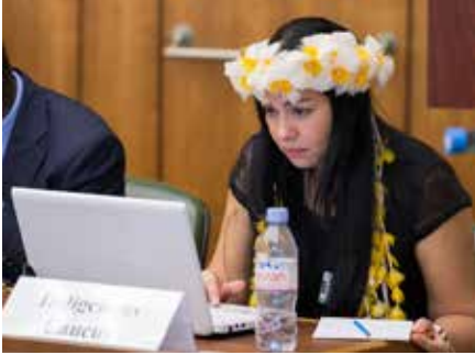
WIPO Intergovernmental Committee on Intellectual Property and Genetic Resources, Traditional Knowledge and Folklore, February 3, 2014

can be used freely at any festival. Works that are based on traditional cultural expressions may be protected by copyright or related rights: for example, a film of a traditional ceremony will likely be protected as a cinematographic work, a recording of a song will attract related rights, a contemporary adaptation of a folksong is probably protected under copyright, and photographs of traditional costumes may not be used without the photographer's permission. In these examples, the use of the work based on the traditional cultural expressions may require prior authorization as is the case for any copyrighted work.