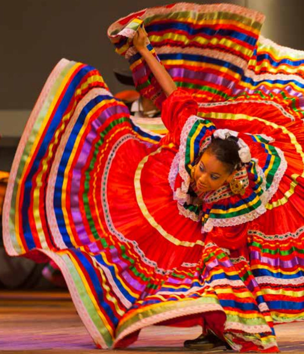
Jalisco Mexican Folkloric Dance, Seoul, Republic of Korea, 2009