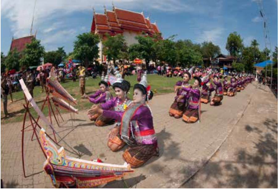
Traditional Thai dancing in Rocket festival "Boon Bang Fai," Yasothon, Thailand, 2013