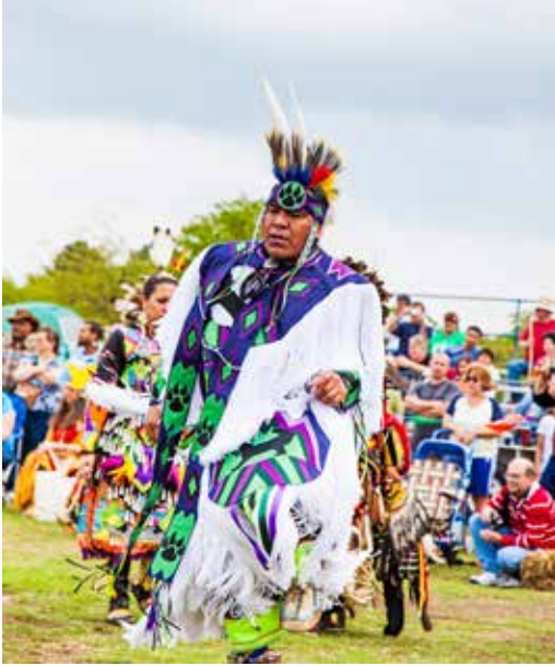
Adults dressed in Native American Indian clothing dancing at the Celebration of Life Pow Wow Festival at Mount Trashmore Park, Virginia Beach, USA, 2011. This was a free public event on public property

Festival organizers can commission professional photographers to document the festival and provide valuable promotional and archival material. A written contract between the festival and the photographer will specify who owns the rights in the photographs (in some jurisdictions, the copyright in commissioned photographs vests in the person commissioning the works; in this case, the festival), all the permitted uses of the photographs (reproduction, display, modification, dissemination, etc.), and the duration and territory of the uses, among other important considerations. The contract could also specify other uses, such as donation of negatives to the festival archive for cultural maintenance purposes.