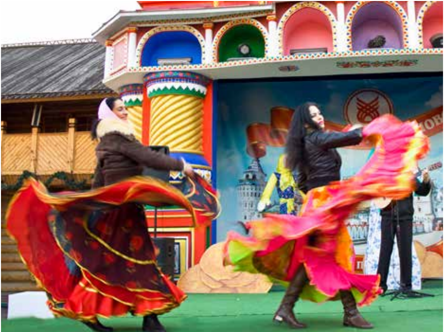
Gypsy artists on street stage during the Maslenitsa carnival, Moscow, Russia, 2014