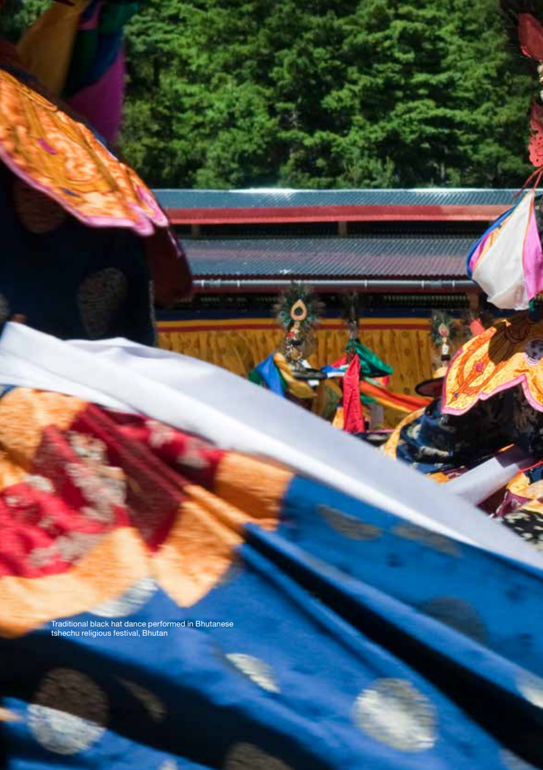
Traditional black hat dance performed in Bhutanese tshechu religious festival, Bhutan