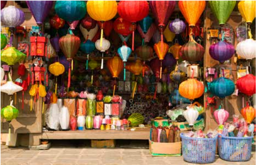
Silk lantern bazaar display, Hoi An, Vietnam